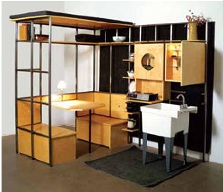
Above: Andrea Zittel's Management .

to at the Gallery." Zittel will talk about her work at 6pm. There's a reception for gallery members that night, 7-10pm.