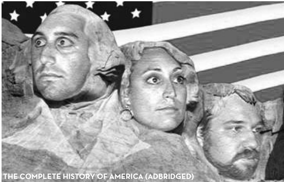
THE COMPLETE HISTORY OF AMERICA (ADBRIDGED)