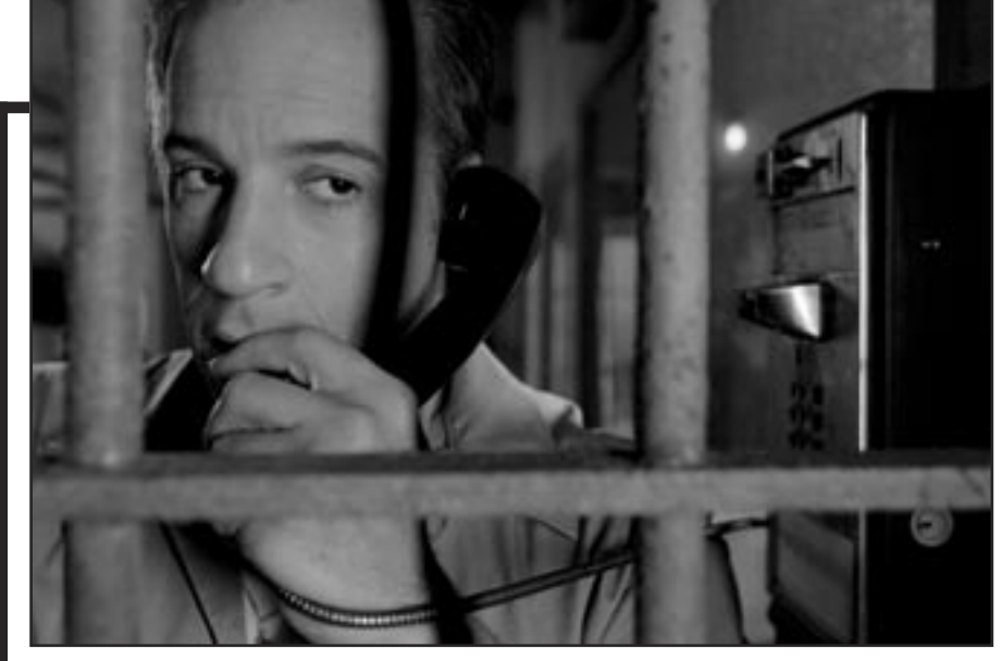
Vin Diesel in Find Me Guilty