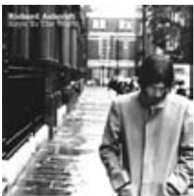
Richard Ashcroft Keys to the World (V2)