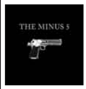
The Minus 5 The Minus 5 (Yep Roc)