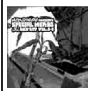
MF Doom The Special Herbs Box Set (Nature Sounds)