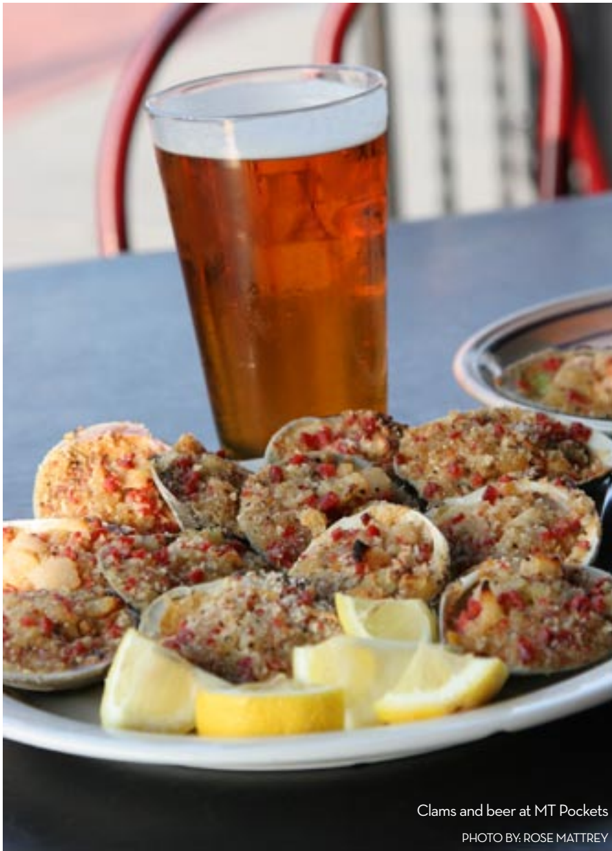
Clams and beer at MT Pockets