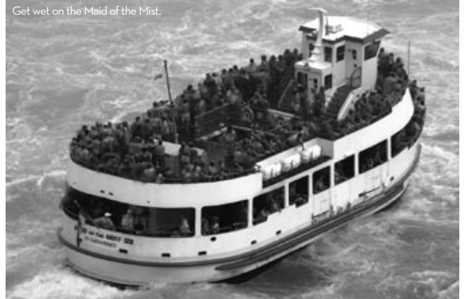
Get wet on the Maid of the Mist.

Festa Italiana (St. John's Church 931 N Union St., Olean) July 19-20. Italian-American cuisine, music, games, children's activities and more. (372-5313)