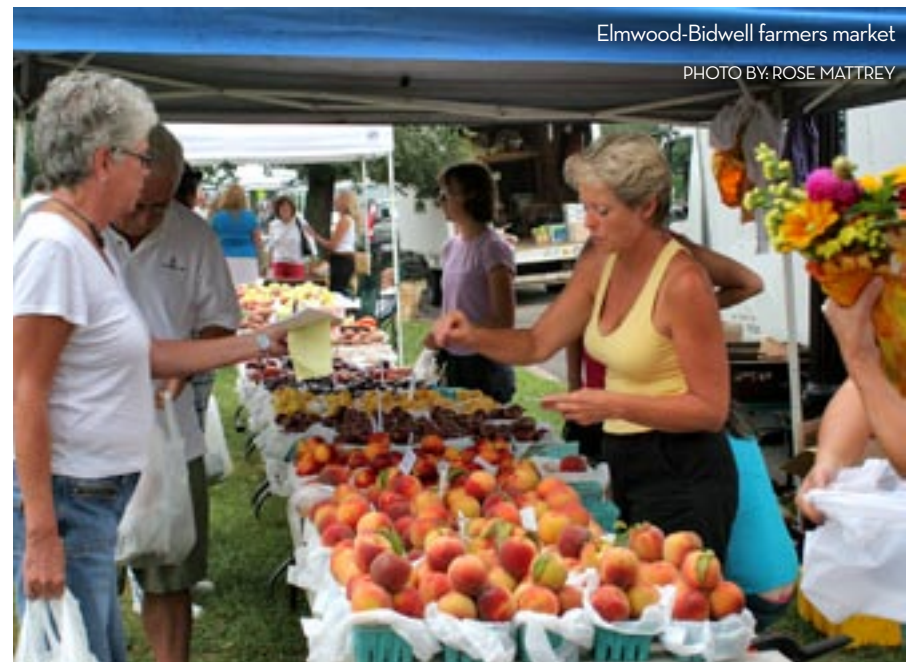
Elmwood-Bidwell farmers market