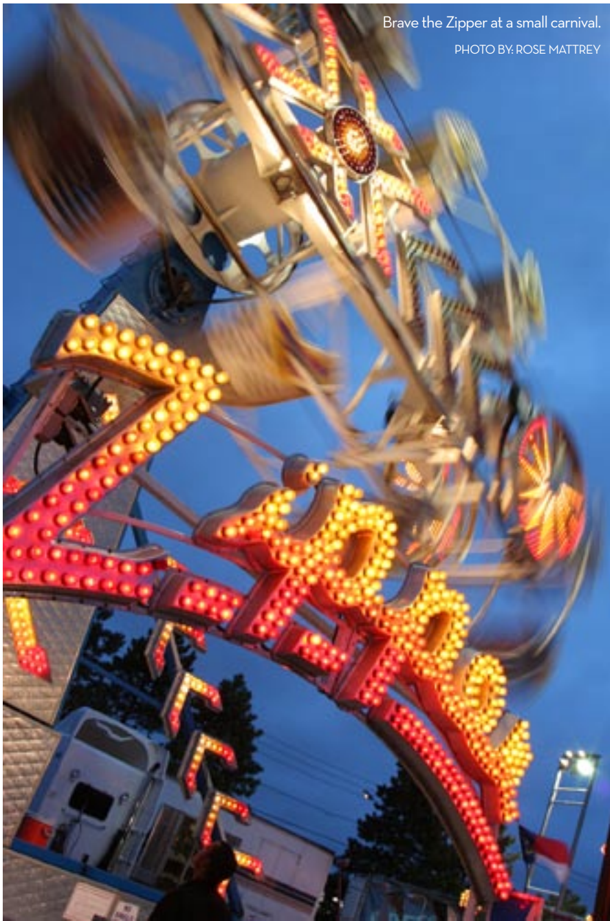
Brave the Zipper at a small carnival.