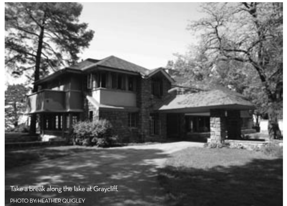
Take a break along the lake at Graycliff.

83. Volunteer. Want to make a difference? Well, did you know that Western New York has the highest per-capita ratio of not-for-profit organizations in the country? There are literally thousands of ways you can help