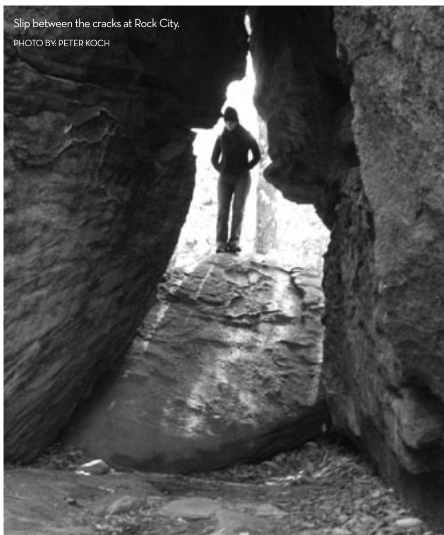
Slip between the cracks at Rock City.

58. Visit the Sonnenberg Gardens. Green thumbs aren't the only ones who'll appreciate the beautiful Sonnenberg estate. The mansion offers free guided tours throughout most of the day, but the real destination