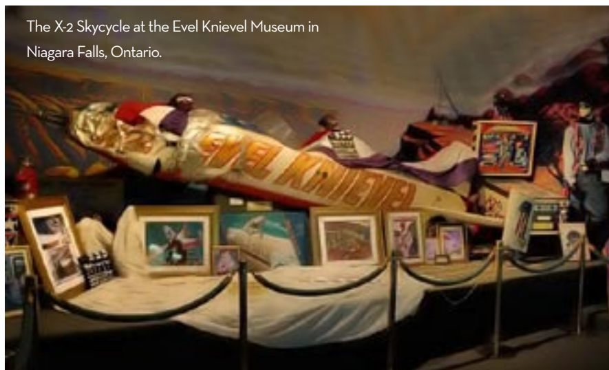
The X-2 Skycycle at the Evel Knievel Museum in Niagara Falls, Ontario.

85. Whittle something. It's a good idea to carry a pocketknife in the summer anyway, in case you should need to steal some peony blossoms from a neighbor's garden. That knife has other uses, however: try whittling.