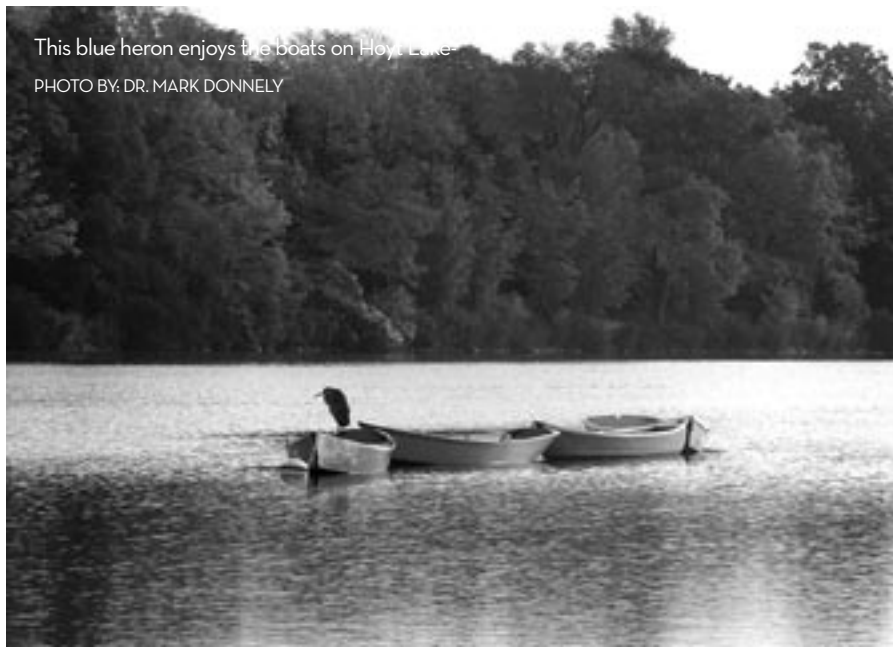
This blue heron enjoys the boats on Hoyt Lake.